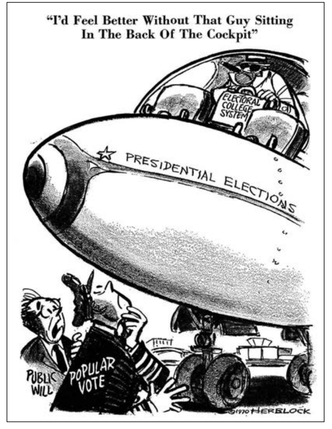
Figure 1.7 Herb Block cartoon of September 15, 1970<sup>108</sup>

total. There was, however, nothing particularly close about the 2000 election on the basis of the nationwide popular vote. Al Gore's nationwide lead of 537,179 popular votes was larger than, for example, Nixon's lead of 510,314 in 1968 and Kennedy's lead of 118,574 in 1960.<sup>108</sup> The closeness of the 2000 presidential election was an artificial crisis caused by the statewide winner-take-all system.