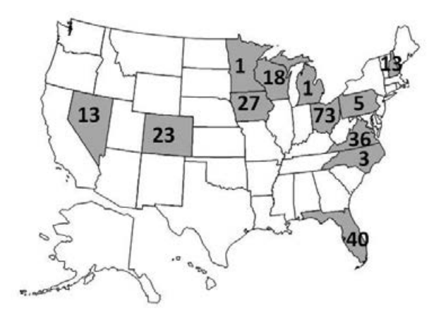
Figure 1.5 Post-convention campaign events in 2012