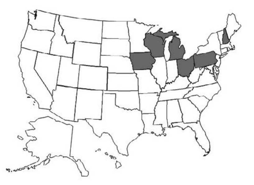
Figure 1.4 The six states visited by the "Every Town Counts" bus tour in June 2012