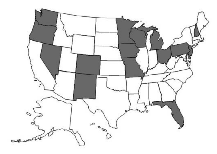
Figure 1.2 Sixteen close states in the 2004 presidential election