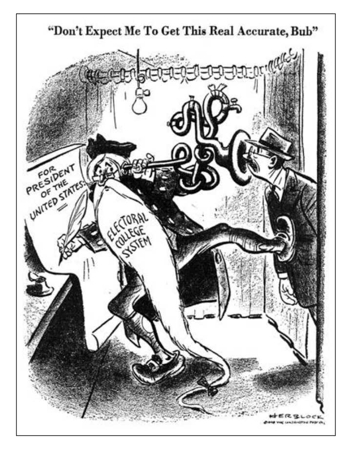
Figure 1.1 Herb Block cartoon of October 7, 19481

The current system for electing the President and Vice President does not satisfy the three principles above. This book presents a politically practical way—based on powers specifically delegated to the states by the U.S. Constitution—by which presidential elections can be brought into conformity with these three principles.