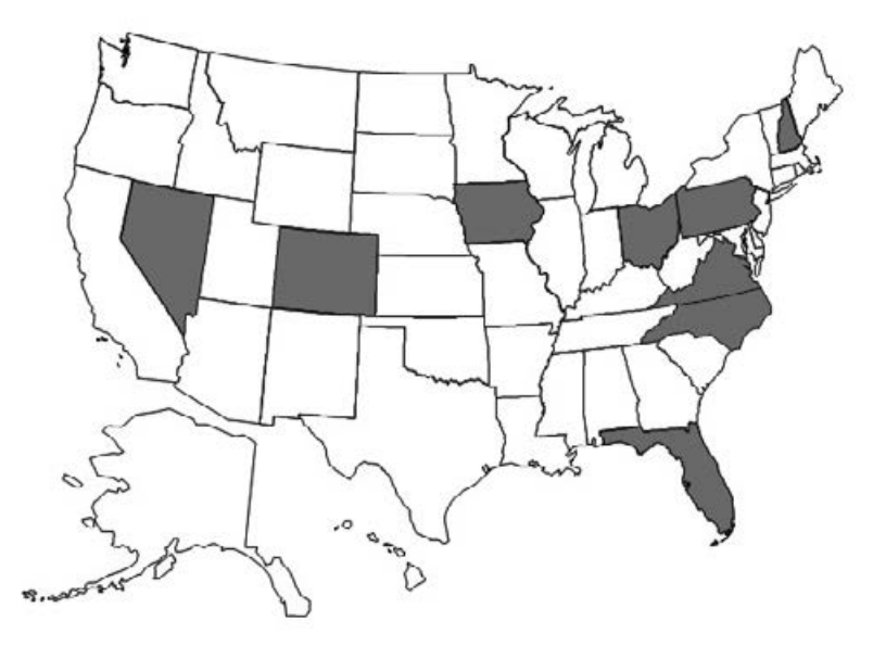
Figure 1.3 Nine battleground states in June 2012